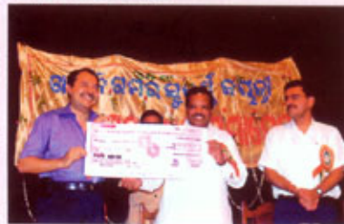
Hon'ble Minister S&M receiving Cheque from Chairman OMC towards State Govt. dividend