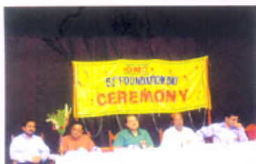
Guests on the dais during the Foundation Day function organised under the aegis of OMC Cultural Association