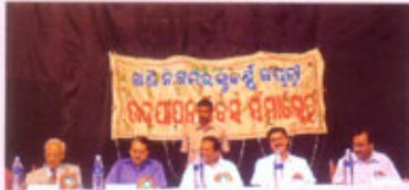
Concluding function of OMC's Golden Jubilee: Guests on the dais.